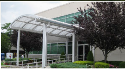
• PARK ATRIUM •